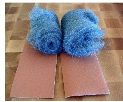
Sand Paper. Steel Wool