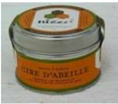
Bizzz™ Bees Wax

Materials and tools required to restore your Bizier countertop.