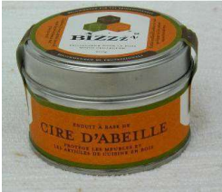
Bizzz™ Bees Wax

Tools and materials required to restore your Bizier countertop.