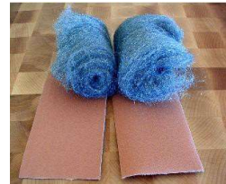
Sand Paper. Steel Wool